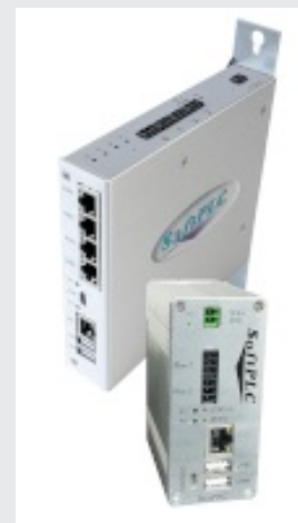
Smart & NeoPAC RIO/DH+ Gateways

We provide Industrial Automation Products